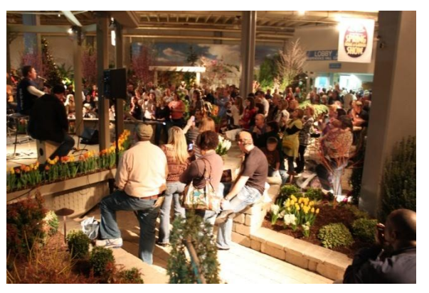
Musical Performance by Country Sensation, Craig Morgan